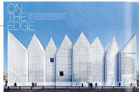
Szczecin, Poland's Philharmonic Hall, designed by Barozzi/Veiga.