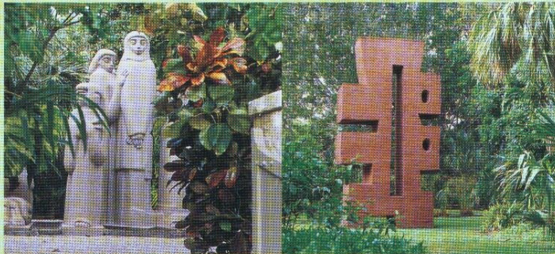
THE ANN NORTON HOUSE AND SCULPTURE GARDENS WEST PALM BEACH, FLORIDA