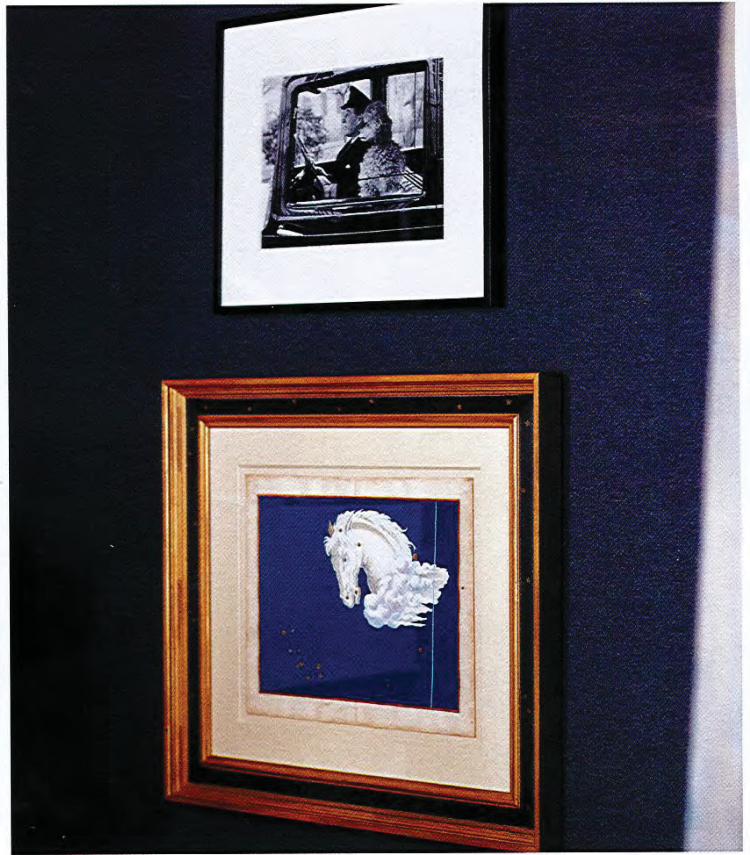
Suite Dreams (OPPOSITE PAGE) In the master bedroom, an antique bed from Anthem pops against walls painted in Benjamin Moore Hale Navy. Pillows are Hermès. Marble table is midcentury Italian. The designer’s eye extends to the master bathroom (ABOVE LEFT), where a collection of handsome objects tops the shelf. Photograph and print (ABOVE RIGHT) on the master-bedroom wall from the designer’s personal collection. See Resources .