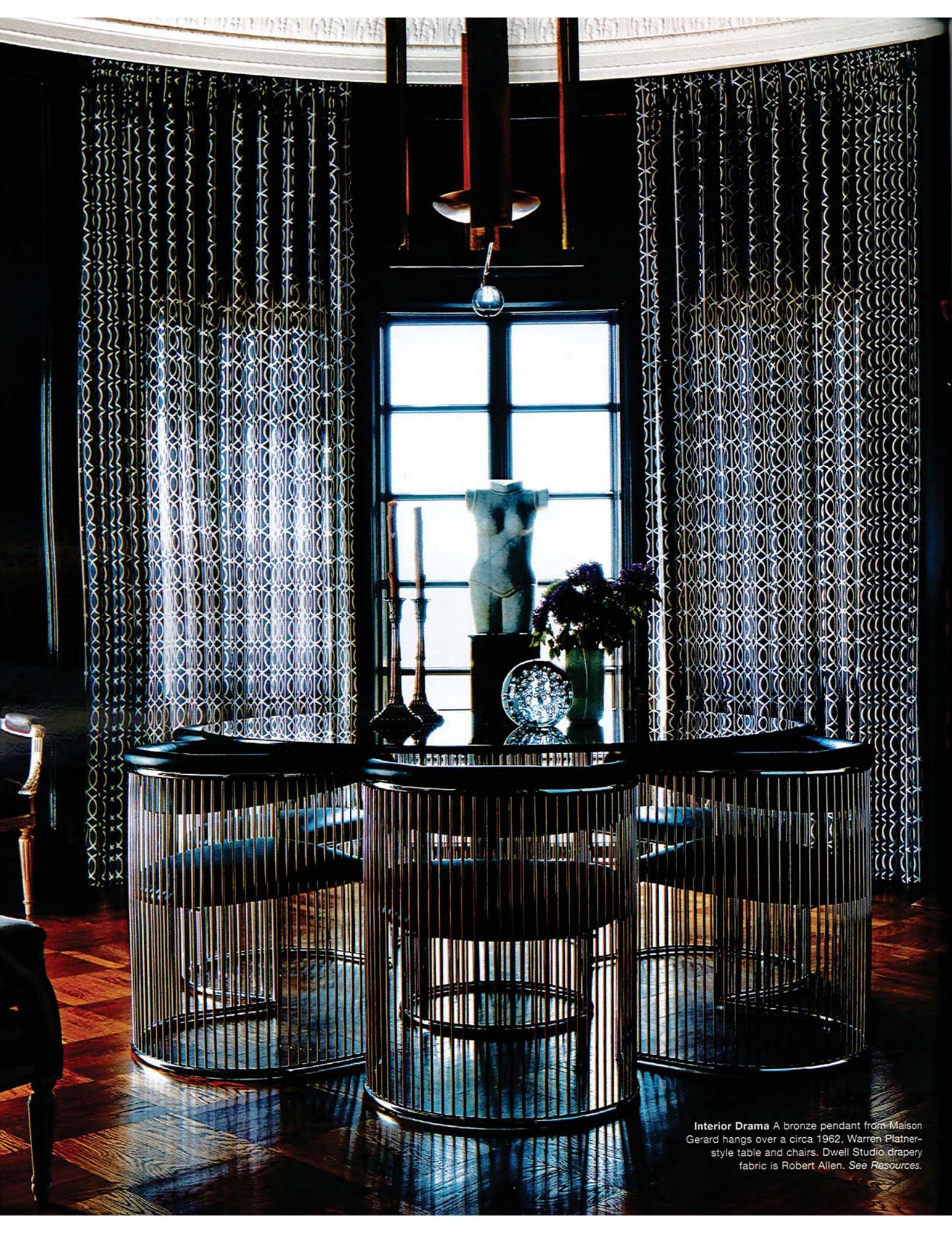
Interior Drama A bronze pendant from Maison Gerard hangs over a circa 1962, Warren Platner-style table and chairs. Dwell Studio drapery fabric is Robert Allen. See Resources .